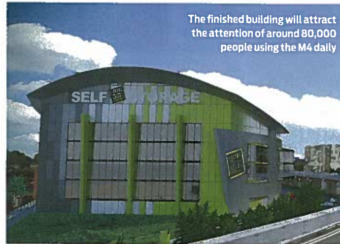
The finished building will attract the attention of around 80,000 people using the M4 daily

Its prominent location means around 80,000 people pass the structure daily, so Big Yellow was